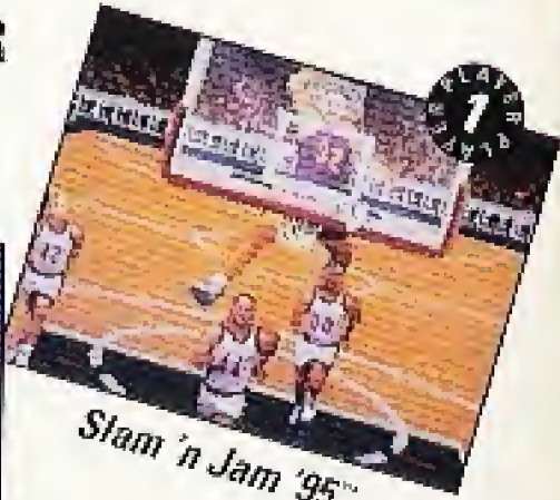
Slam 'n Jam '95™

SPECIAL BONUS INCLUDES 3DO STORAGE MANAGER UTILITY